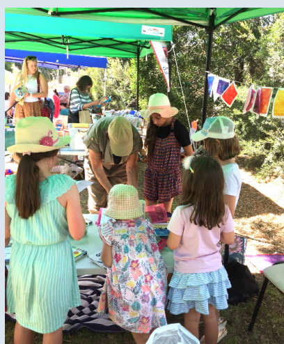
Children engaging with phonetic learning materials