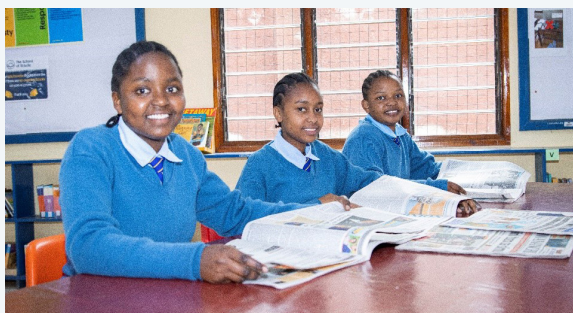
Students from St Jude's Girls' Secondary School catch up on the news during lunch time.